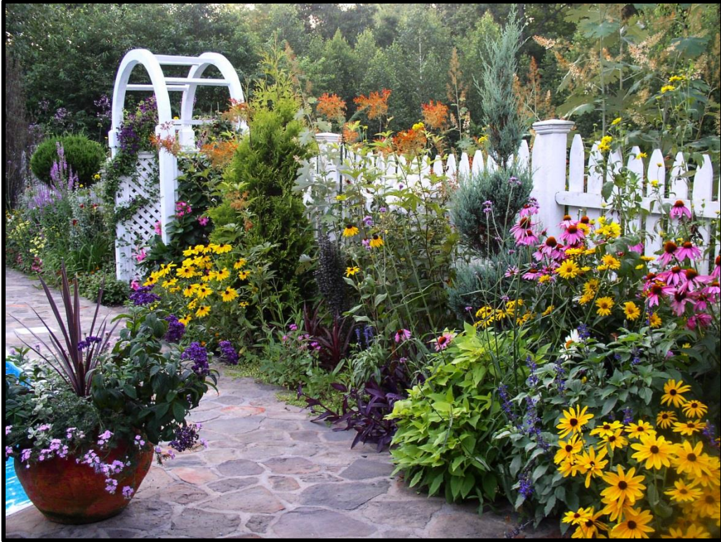
Class 13: Recital 'Garden Path' by Tony Poitras, First Place