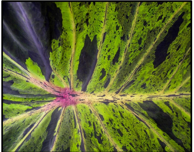
Class 14: Selfie 'Radiation 3' by Tony Poitras, Third Place